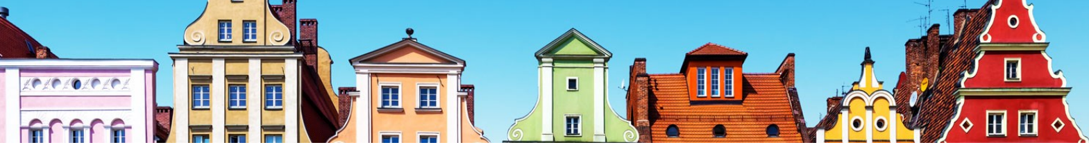
CHART 1. REVITALIZATION OF THE TENEMENT HOUSE AT 13/15 FOKSAL STREET IN WARSAW